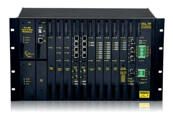
Front View - VCL-MX Version 6

VCL-MX Version 6 - 80 x E1 Multiplexer may be used for inter-connecting legacy voice and data networks, provisioning and managing bandwidth on a E1 channelized level as well as 64Kbps, DS-0 time-slot level and can be used as a digital-access cross-connect equipment. This solution also provides 4 x Binary (110VDC / 220VDC) Commands Teleprotection interface for providing Distance Protection and IEEE C37.94 optical (MM / SM) ports for providing Distance / Differential Protection.