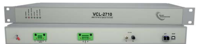
1U high, standard 19-inch Rack Mount Version