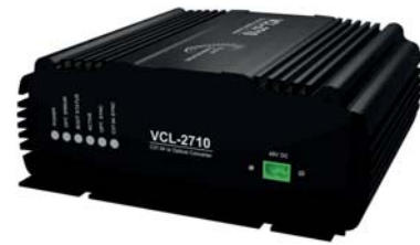
DIN Rail Mount Version